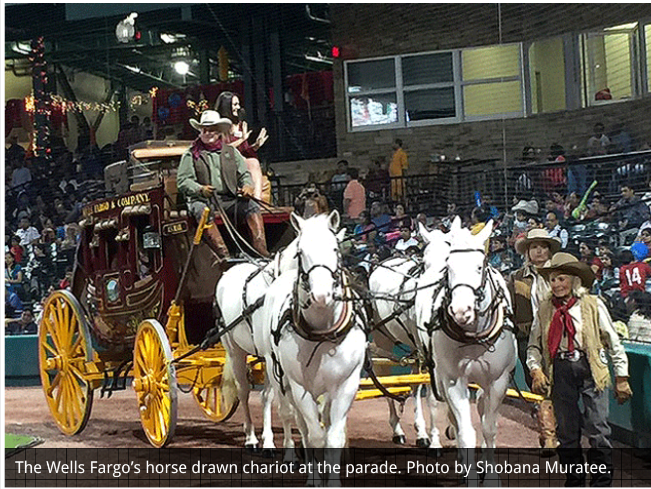
The Wells Fargo's horse drawn chariot at the parade.