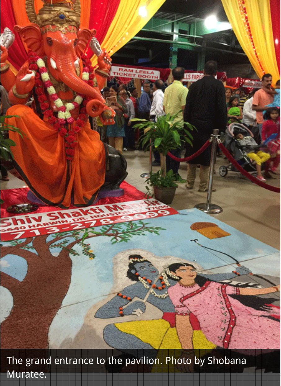
The grand entrance to the pavilion.

With setting sun, the stadium lights shone brighter showing a packed stadium. At the entrance, welcoming all was the gigantic orange idol of Lord Ganesha, the dispeller of all evil. Before Him was a delicate rice rangoli (floor art) of Shri Sita Ram that was a treat to many eyes.