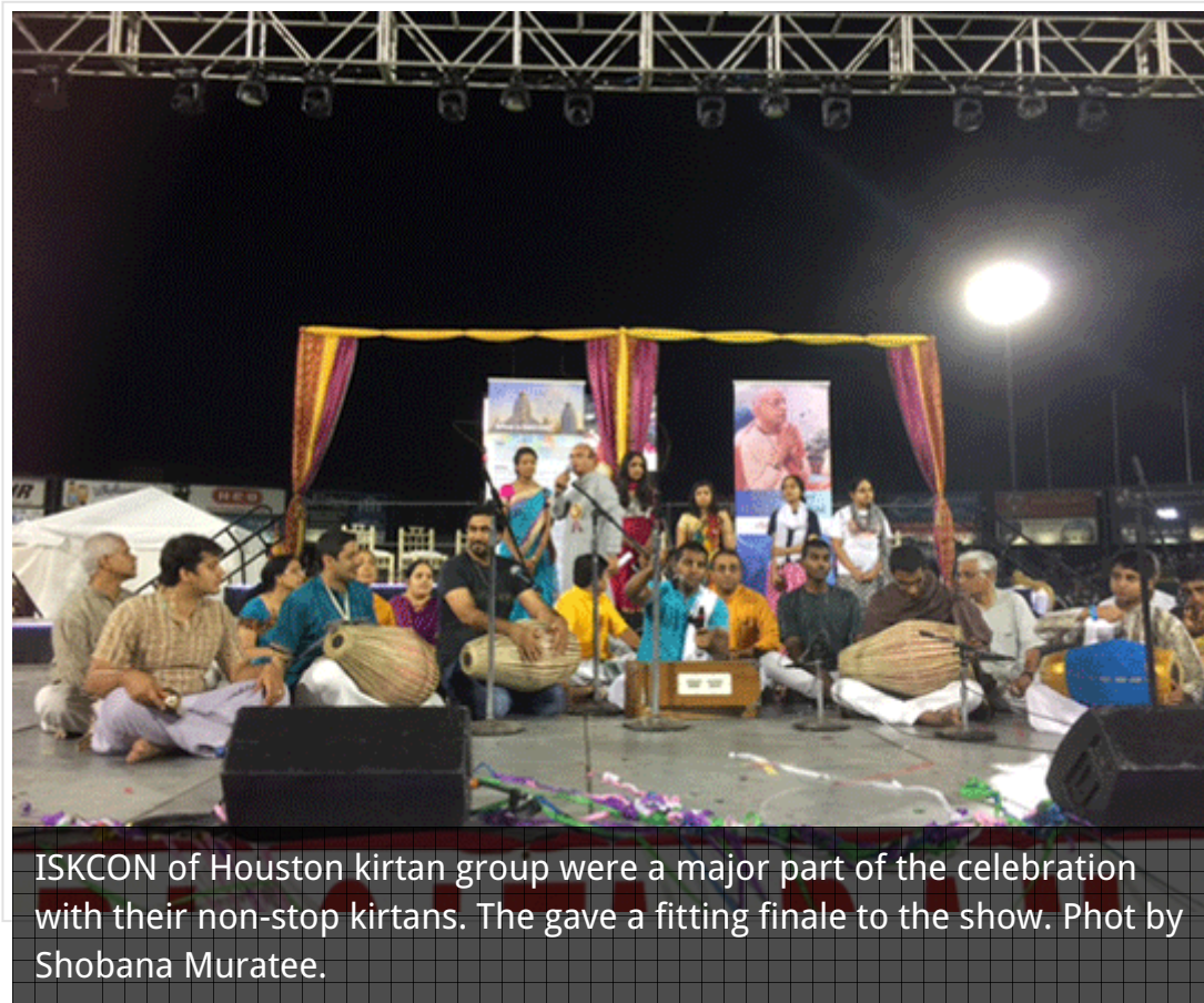
ISKCON of Houston kirtan group were a major part of the celebration with their non-stop kirtans. The gave a fitting finale to the show.