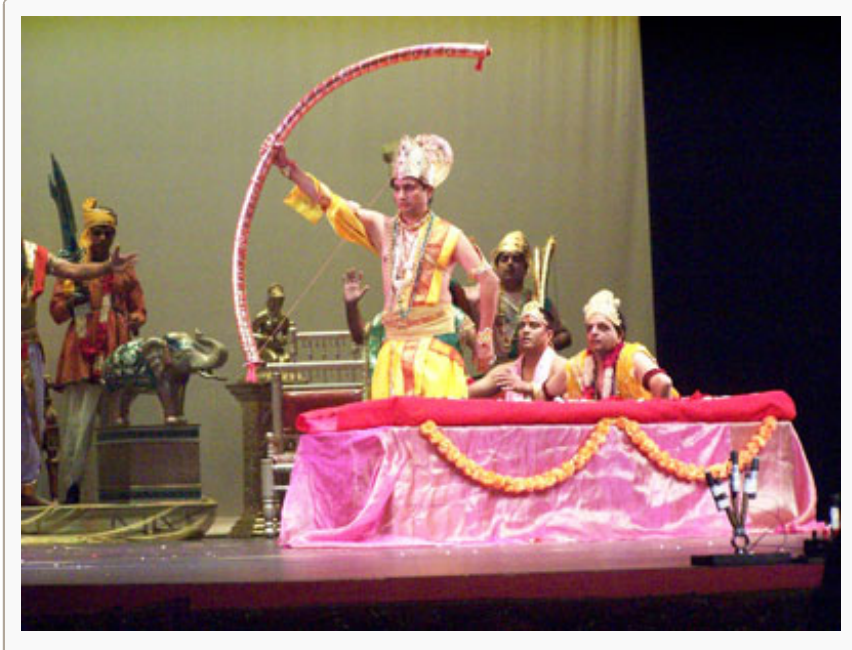
Artists performing at the Ram Leela Show in Houston

It was a sentiment echoed by many of the first generation immigrants who had come there, many with their own children in tow, to once again feel the sentiments that an early winter's night in India used to elicit. Ram Leela is a tradition that is prevalent in North India and each village square, each city district and each neighborhood have their own version staged to huge crowds